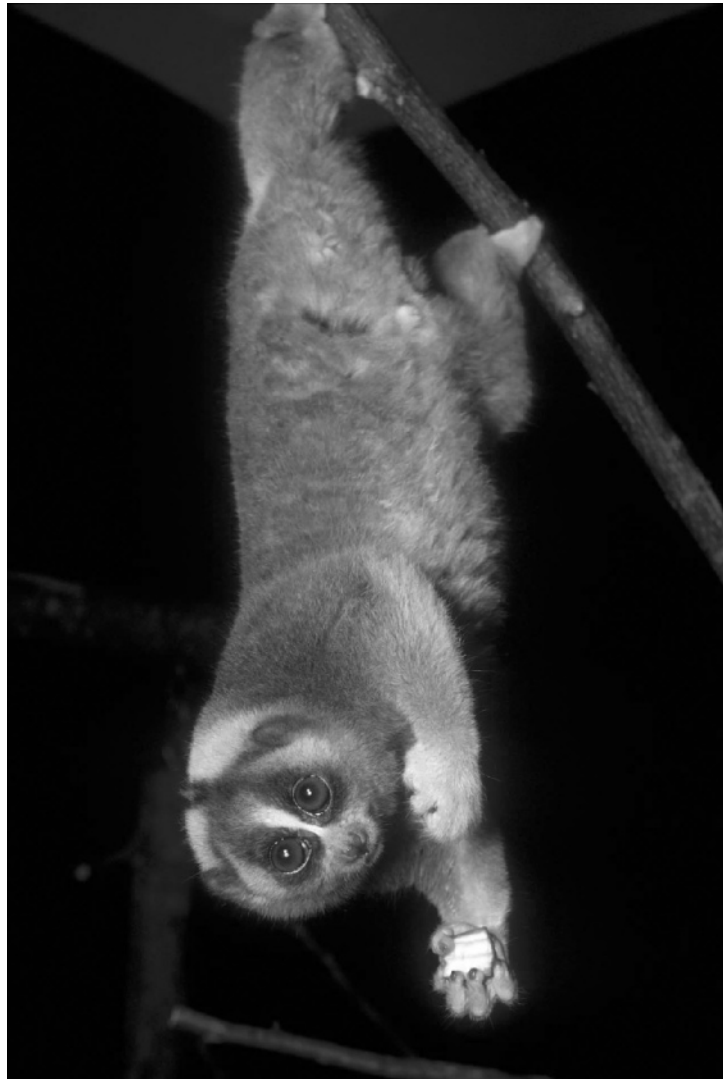
Slow Loris The slow loris is a strictly nocturnal prosimian or primitive primate from the forests of Southeast Asia and Indonesia. Slow and methodical until it gets within reach of an insect, it is aided in its nighttime activities by acute vision and the powerful grip afforded by its opposable big toes and thumbs.