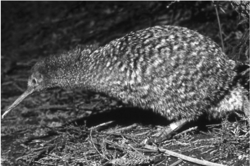
Great Spotted Kiwi With poor eyesight, smell is the kiwi's most important sense. Unlike all other birds, its nostrils are at the end of the beak, and it probes in the soil to locate the earthworms that are its main source of food.