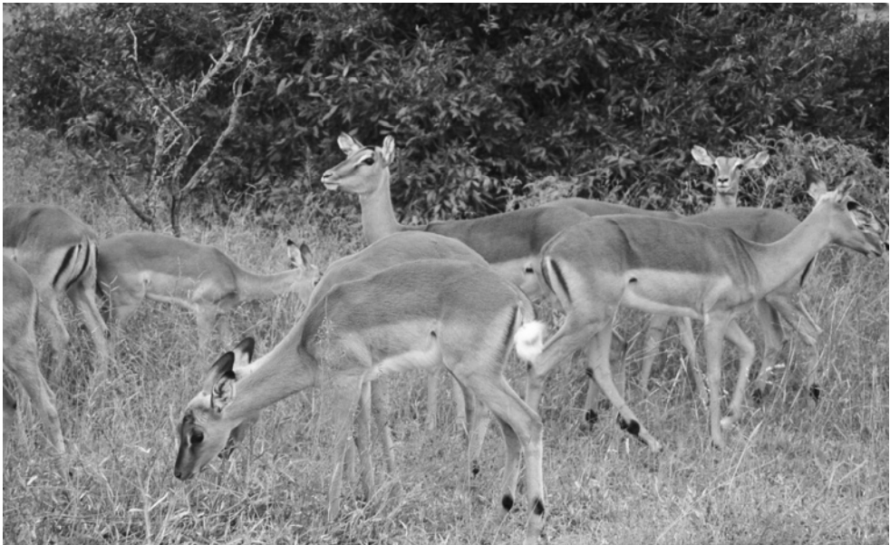
Impalas The common antelope of the grasslands and bushveldt of South and East Africa, the diurnal impala is a major prey species of lions, leopards, and spotted hyenas by day and night, and its calves are taken by ratels, jackals, and caracals.

An unusual diurnal antelope, in which the back slopes down from the withers to the rump, the wildebeeste stands 57 inches (1.45 m) at the shoulder and weighs 600 pounds (275 kg). It is grayish-silver with a black face, beard, mane, and tail, and both sexes have upward-pointing horns that curve inward. Gnu have a wide distribution from southern Kenya to northern South Africa, where they graze the open, grassy plains and wooded savannahs and are the dominant large mammals on Tanzania's vast Serengeti Plains. They usually live in small herds of about thirty animals, with several herds controlled, and patrolled, by territorial males. The herds follow seasonal grass growth, moving on when areas are depleted, and predicting the rainfall; they are famous for their mass migrations, which become virtual death marches when their route takes them twice annually across rivers where Nile crocodiles lie in ambush. Gnou (their Hottentot name) are seasonal breeders, with all births occurring about three weeks before the rains begin, so the calves have access to fresh grass when they are weaned. Birthing time is a period of intense excitement for predators, which circle the herds seeking an opportunity to seize a calf before it can run; but they must be quick, because calves stand within a