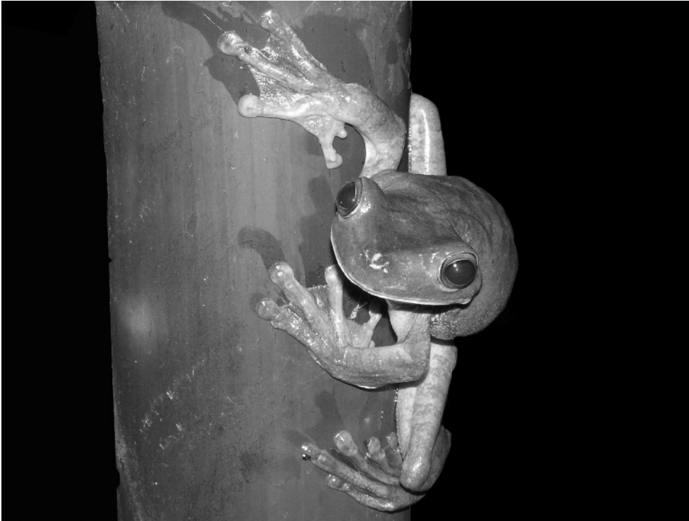
Gladiator Tree Frog Large eyes projecting from its skull and enormously enlarged pupils in darkness provide this neotropical tree frog with exceptional night vision as it searches for insects while clinging to smooth surfaces with its toe pads.