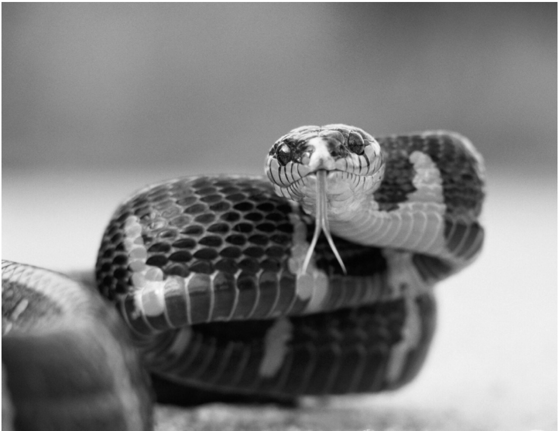
Mangrove Snake The mangrove snake's continually flicking forked tongue collects chemical compounds (scent particles) from the air and transfers them to pits in the roof of its mouth, from where a message is transmitted to the brain for analysis.

The function of the flicking tongue is to collect and transfer scent particles to two pits in the roof of the mouth, from where messages are passed to the brain for analysis. The advantage of a forked tongue is that it allows the snake to determine the direction from which the scent came. These mouth pits contain sensory neurons similar to those in the nose, which detect chemical compounds, including pheromones (which carry messages between animals of the same species) and