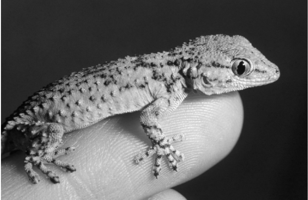
Moorish Gecko A tiny hatchling of this Mediterranean species that reaches a length of 6 inches (15 cm) when adult. A lizard of the arid rocky regions, it has been introduced into California where it is now established.

appropriately called day geckos, are bright green with red markings. Geckos live on tree trunks in the rain forest, among the rocks in semiarid regions, and are familiar in houses in warm climates where they benefit from insects attracted by the artificial lighting; and where their ability to climb glass and smooth walls is so obvious. In this situation they are the most well known of all the nocturnal lizards.