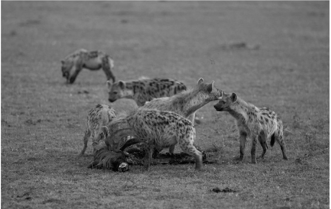
Spotted Hyenas A pack of spotted hyenas make short work of their prey on the East African plains. Once believed to be just scavengers of lions' leftovers, they are now known to band together to actively hunt antelope, zebras, and gnu, and lions may actually scavenge their kills.