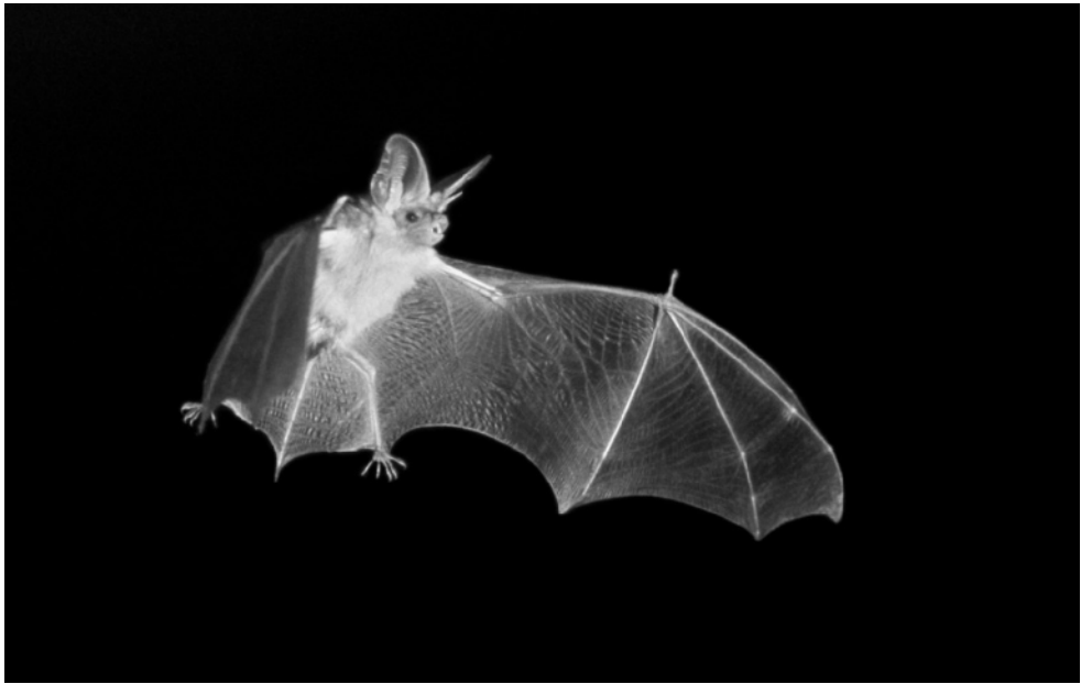
Hemprich's Bat An insectivorous Palearctic species, showing the typical bones of a vertebrate forelimb modified for flight, with extremely elongated fingers, all enclosed together with nerves and blood vessels between two layers of skin. The tail in this species is also enclosed—by the interfemoral membrane.