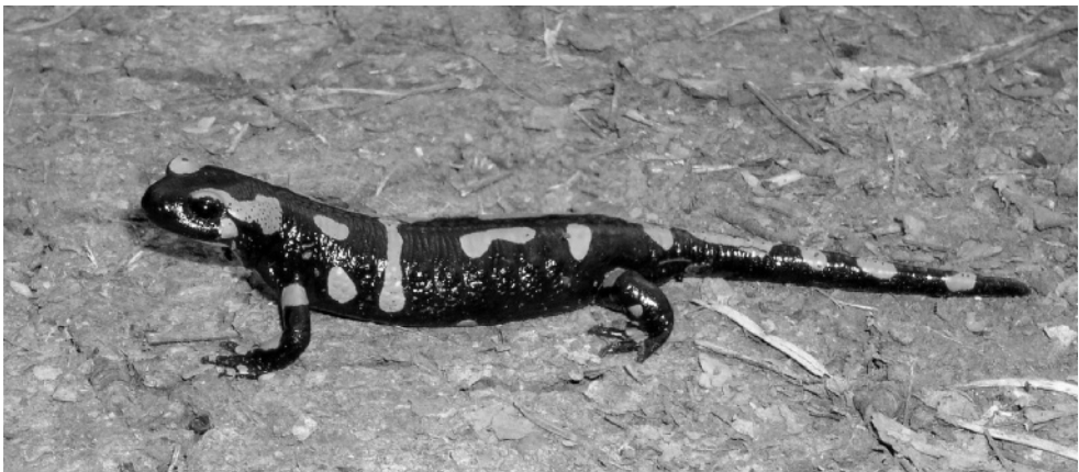
Fire Salamander A terrestrial species when adult, the fire salamander from Eurasia and North Africa is starkly patterned to warn potential predators that its skin glands contain a powerful neurotoxin which can be fatal to small mammals.

A native of Europe, North Africa, and southwest Asia, the fire salamander is a large and robust animal that reaches a length of 12 inches (30 cm) including its tail. It has well-developed poison glands concentrated around the head and on the back, which contain the neurotoxic alkaloid samandarin, but is brightly colored to warn potential predators of its toxicity. Although individuals vary considerably in color they generally have bright yellow, orange, or reddish spots or stripes on a glossy black background. They are found in damp forest, rarely far from water, and roam nocturnally following rainfall. A breeding male produces a packet of sperm