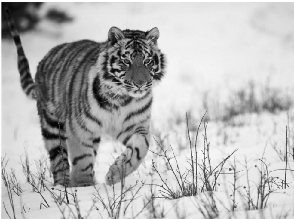
Siberian Tiger The largest cat, the Siberian tiger is now a very rare animal, restricted to a small area of forest in far-eastern Russia and neighboring North Korea. It hunts red deer, sika deer, and wild boar, mainly at night, caching for later what it cannot eat.

a record of 840 pounds (381 kg), and such large animals would measure 12 feet (3.6 m) from nose to tail tip. The Siberian tiger is the subspecies adapted for life in the harsh winter conditions of eastern Russia, where the temperature may reach -40^{\circ}\text{F} ( -40^{\circ}\text{C} ). It has a long yellowish coat in winter, which becomes reddish in summer, with a creamy-white belly and flanks. There are white patches over the eyes and the muzzle is white, the ears are black with a white spot on the outside and white inside, and the tail is black and white. The Siberian tiger's coat is much thicker and longer than the other races of tiger; it has less stripes than the others and they are more brownish than black, and there is little striping on the outside of its front legs. It is now a very rare animal due to poaching and the loss of its forest habitat from clear-cutting and fires. Originally occurring from Lake Baikal to Russia's Pacific coast, it is now confined to the heavily forested Ussuri Region of eastern Russia in the Sikhote Alin Mountain Range, and possibly in North Korea. The wild population is about 350 animals, but it is well represented in zoological gardens. The tiger's natural prey includes red deer, sika, and wild boar, and it is claimed that an adult male can eat up to 88 pounds (40 kg) of flesh per day, covering the remainder of its kill with grass and leaves for later use.