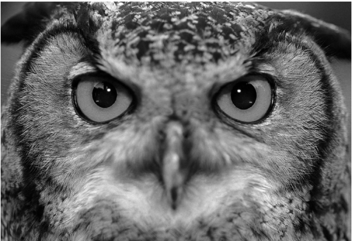
Eagle Owl Facing forward and providing stereoscopic vision, the eagle owl's eyes are the largest of all birds in relation to its size. Tubular in shape and with a large lens and wide pupil, they occupy as much room in the skull as the bird's brain.

Large eyes, with increased retinal surface, larger lens, and wider pupil, are all adaptations to collect more light. The owl's increase in eye size has been achieved by developing tubular eyes, so large that they occupy half of the skull. The avian retina, unlike that of the mammals, has no blood vessels and is said to be avascular, which prevents shadow and light scattering. This is because of the presence of the pecten, a vascular structure that projects from the retina into the vitreous humor from which nutrients and oxygen diffuse. The owls have a smaller pecten than diurnal birds and therefore their power of accommodation or automatic adjustment is limited. The front-facing eyes of the predators provide binocular or stereoscopic vision—overlapping fields of sight of each eye—which increases the perception of depth and improves their ability to locate and seize their prey.